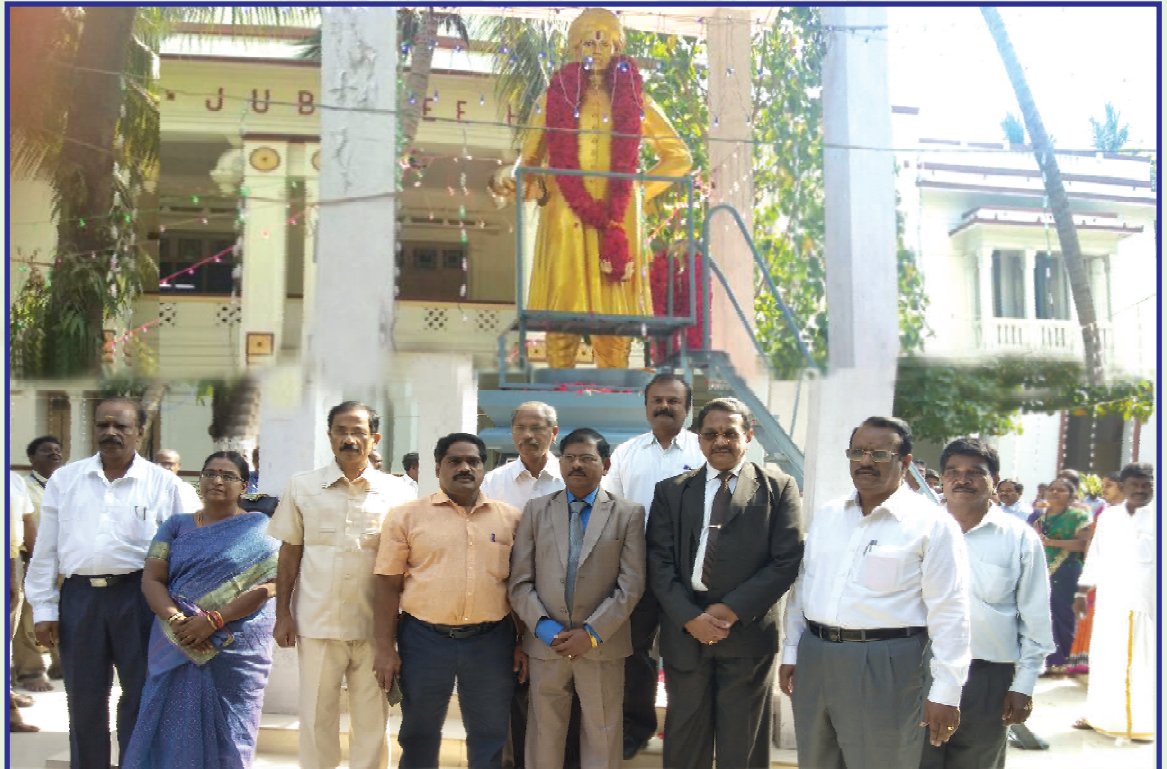
Hon'ble Chairman and Trustees Honour the Founder Statue after assuming charge on 15-11-2017